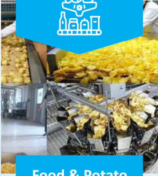
Food & Potato Processing